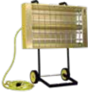
Portable Cart Unit CH 6424-1C with FHK-1 Cart