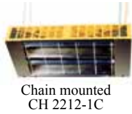
Chain mounted CH 2212-1C