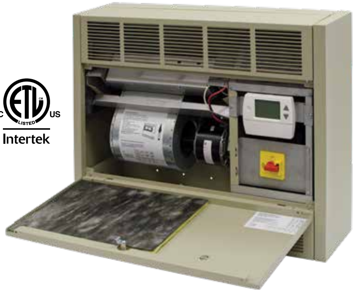
SD Setback Thermostat Option

⚠ WARNING: This product can expose you to chemicals including nickel which is known to the State of California to cause cancer, and chromium, which is known to the State of California to cause birth defects and/or reproductive harm. For more information go to www.P65Warnings.ca.gov .