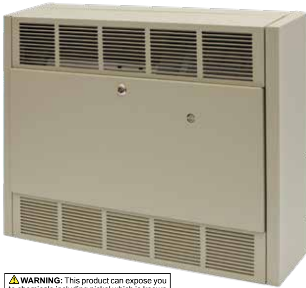
Locking Cover Option