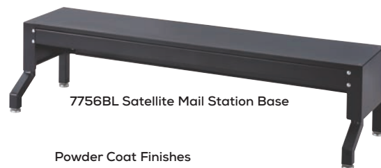
7756BL Satellite Mail Station Base