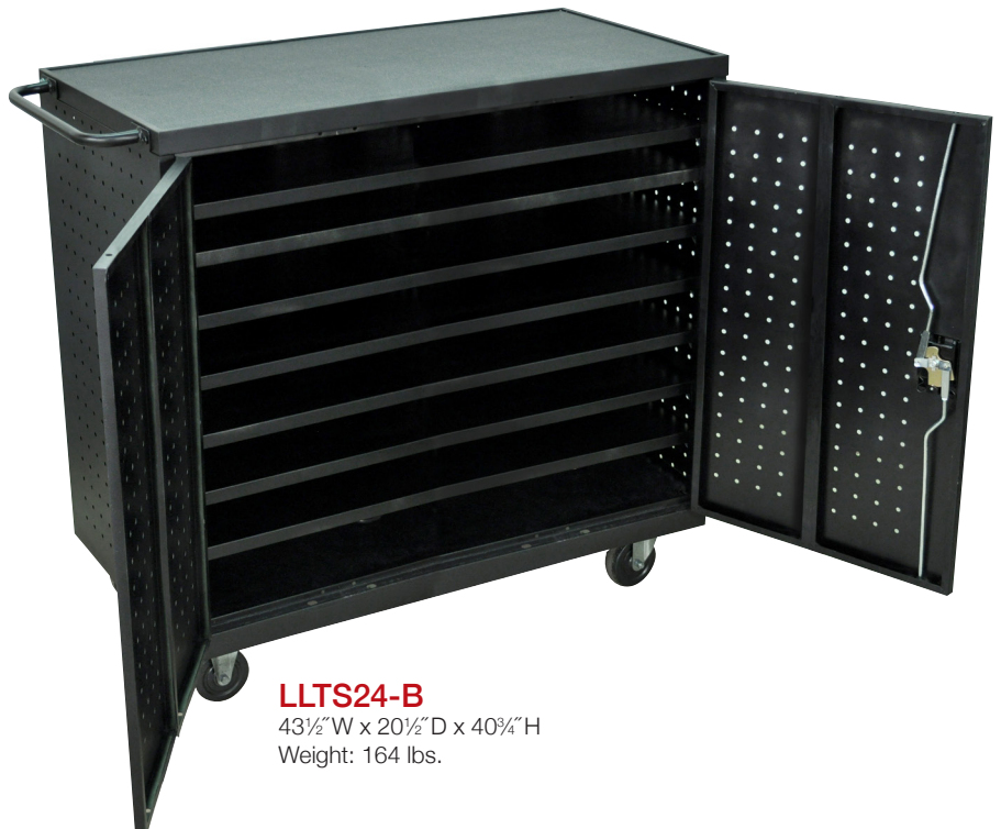
LLTS24-B 43 1 / 2 " W x 20 1 / 2 " D x 40 3 / 4 " H Weight: 164 lbs.