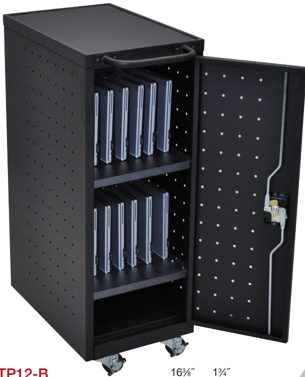
LLTP12-B 14"W x 24 3 / 4 " D x 39 5 / 8 " H Weight: 66 1 / 2 lbs. Min/Max Laptop / Chromebook: