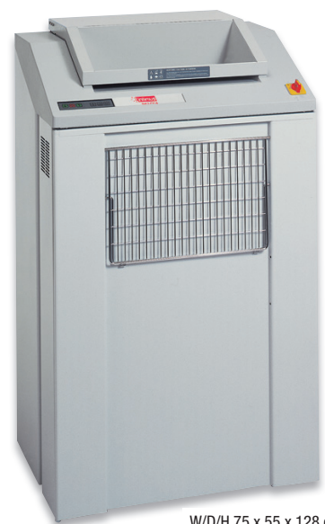
W/D/H 75 x 55 x 128 cm

Professional Data Shredders – a Synthesis of Technology, Performance and Design. All intimus® shredders are built from durable, precision engineered, high-performance components, designed for a long life of high volume usage. The product range covers all requirements from day-to-day office use up to High Security Shredding machines in use for destruction of classified material in line with all current legal requirements such as DIN 66399 or NSA 02/01. intimus® shredders carry various features which make them unique in user-friendliness and operating efficiency.