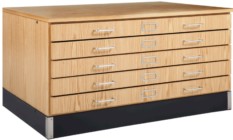
Unit above includes one of each : FFST-3624M (Top), FFS-3624M (Drawers), and FFSB-3624 (Base)